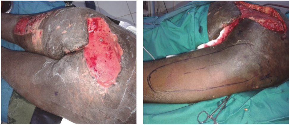
FIGURE 1: First patients with extensive sacral wounds and markings for the flap.