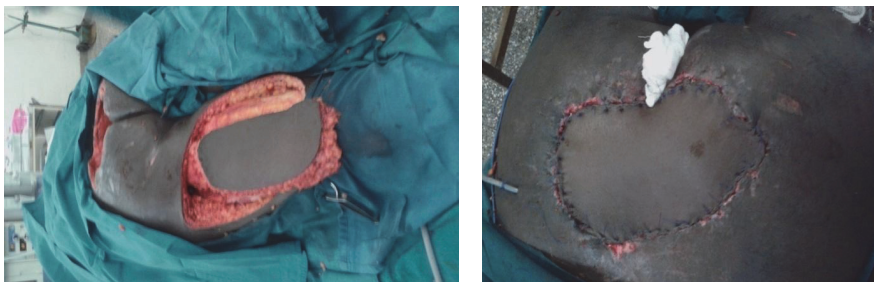
FIGURE 4: Flap being raised and inserted in the recipient site of the second patient.