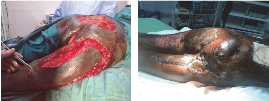
FIGURE 2: Island posterior thigh flap being raised in the first patient with no recurrence at three months of follow-up.