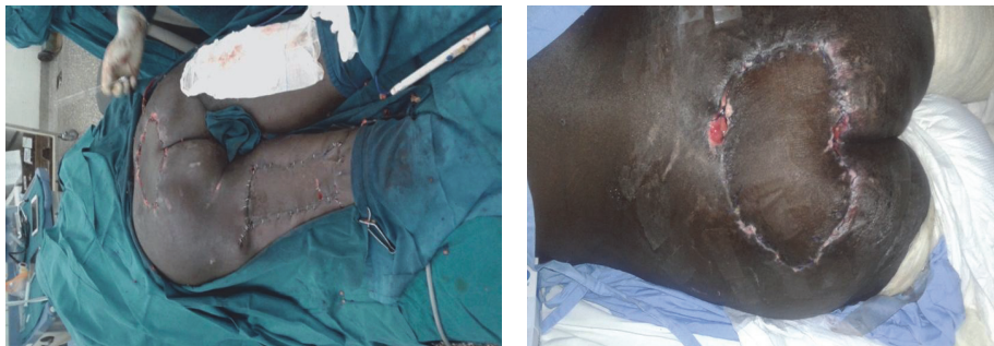
FIGURE 5: Skin graft of the donor site with the flap fully taken with no recurrence at one month after surgery.