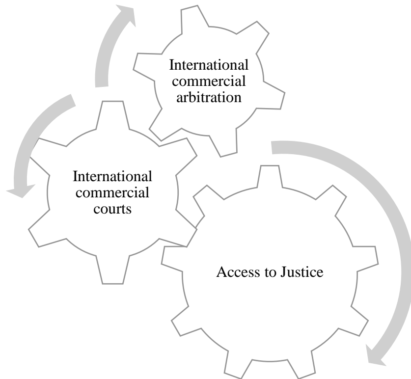
Fig 1: Conceptual interplay between international commercial arbitration, international commercial courts and the right of access to justice 55

This section has presented the conceptual framework guiding this study. The key concepts have been illustrated to show the guiding mind-set of the study. The concepts of international commercial arbitration co-existing with international commercial courts are presented as joint contributing factors to realising the right of access to justice.