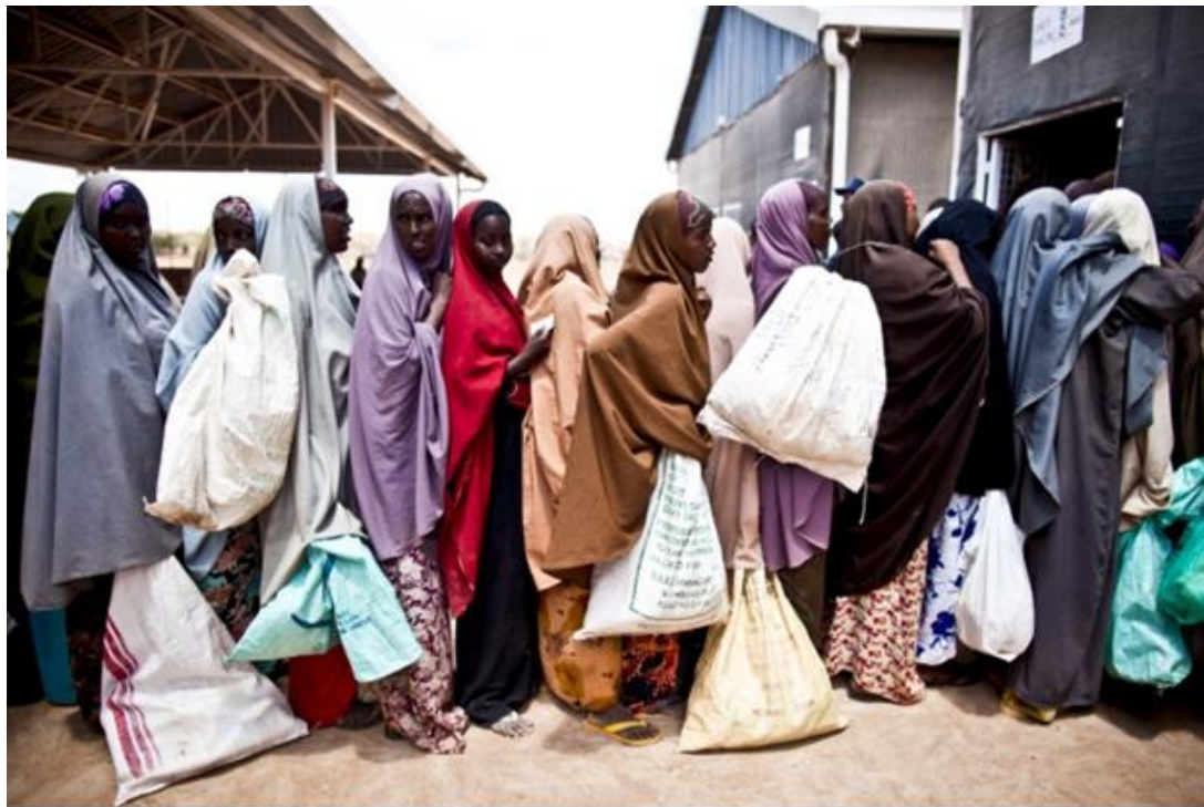
Picture 4.1: Somalia Women refugees lining up for their monthly food ration at the Ifo.

new contributions to prevent food stocks from running out. Women refugees say the ration cuts make their already difficult lives even harder. 146