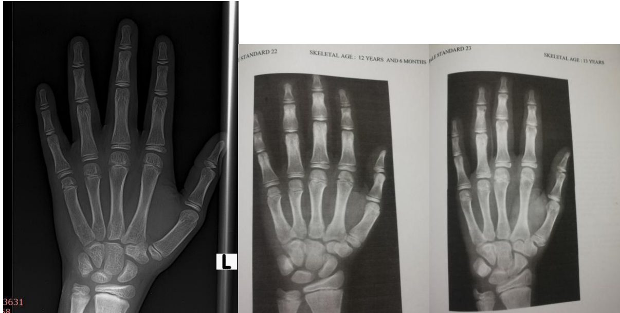
Chronological age : 13 yrs 1 month Skeletal age : 12 yrs 6 months