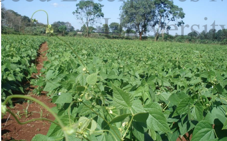
New Field planted with Kenya Red Kidney