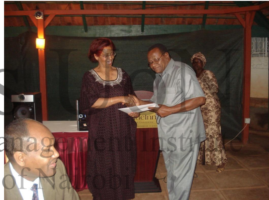
Certificate presentation on Graduation