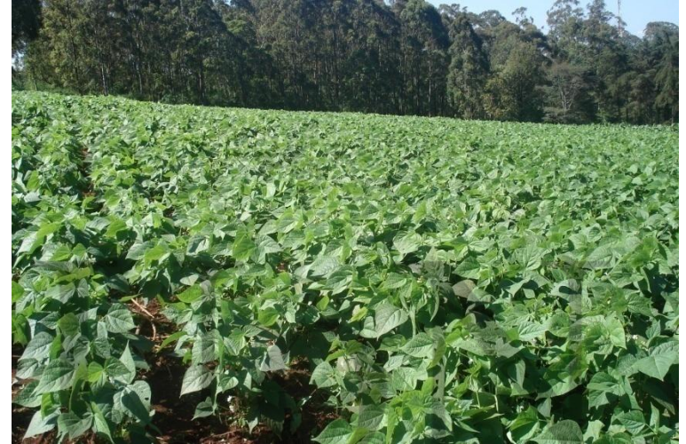
Newly Opened up fields at CAVS