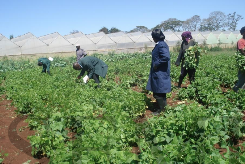
Inspection and Roguing with KEPHIS staff at CAVS