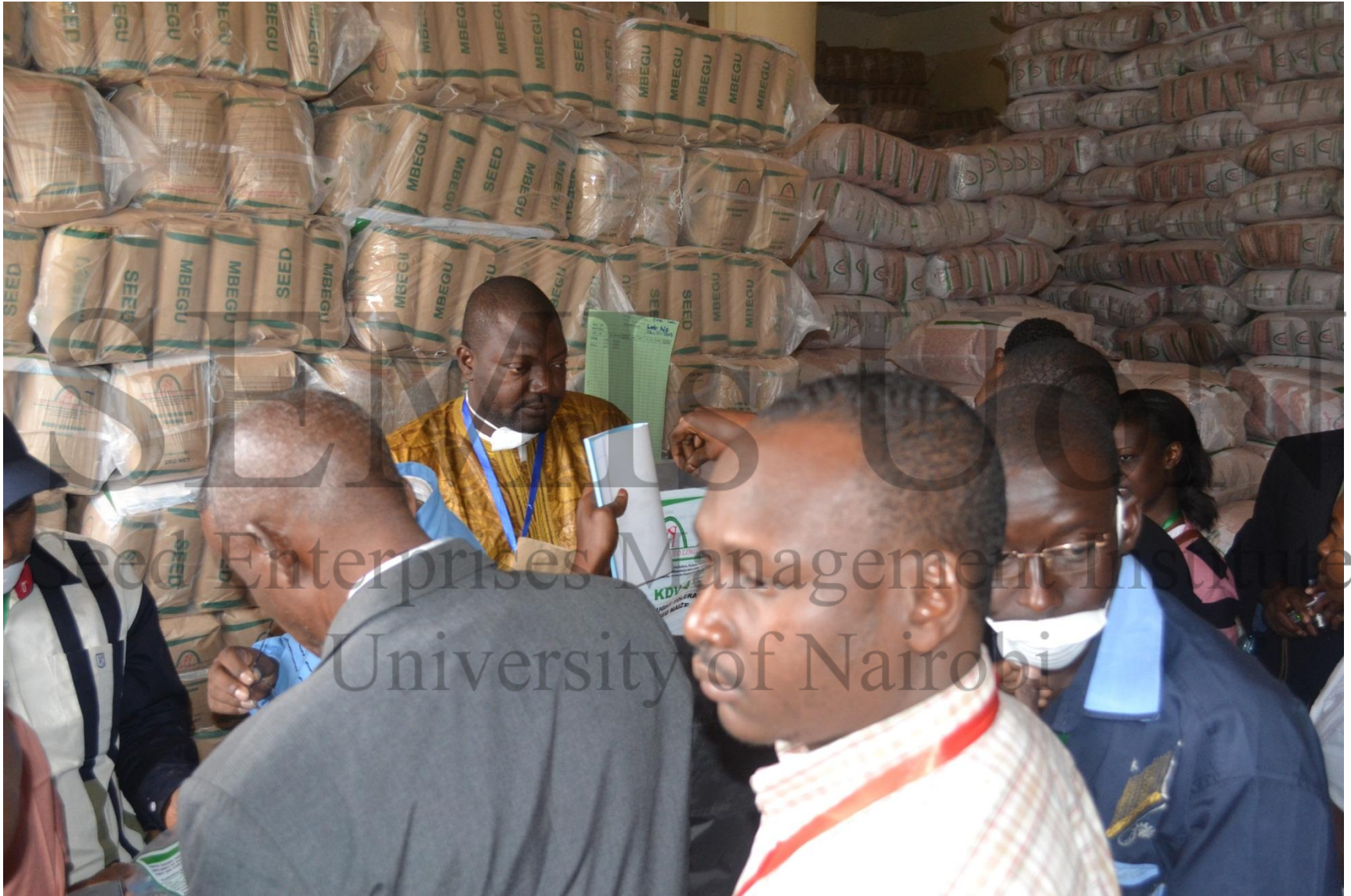
Dry land Seed company seed store in Machakos