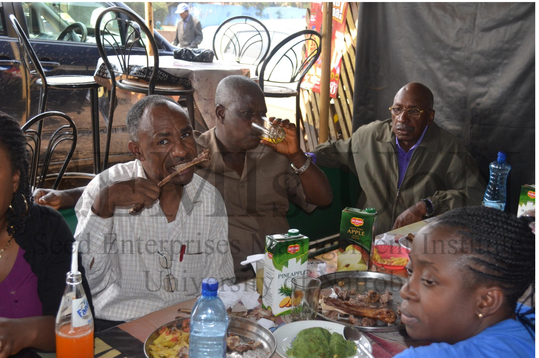
Nyama Choma After a hard week of seed Business