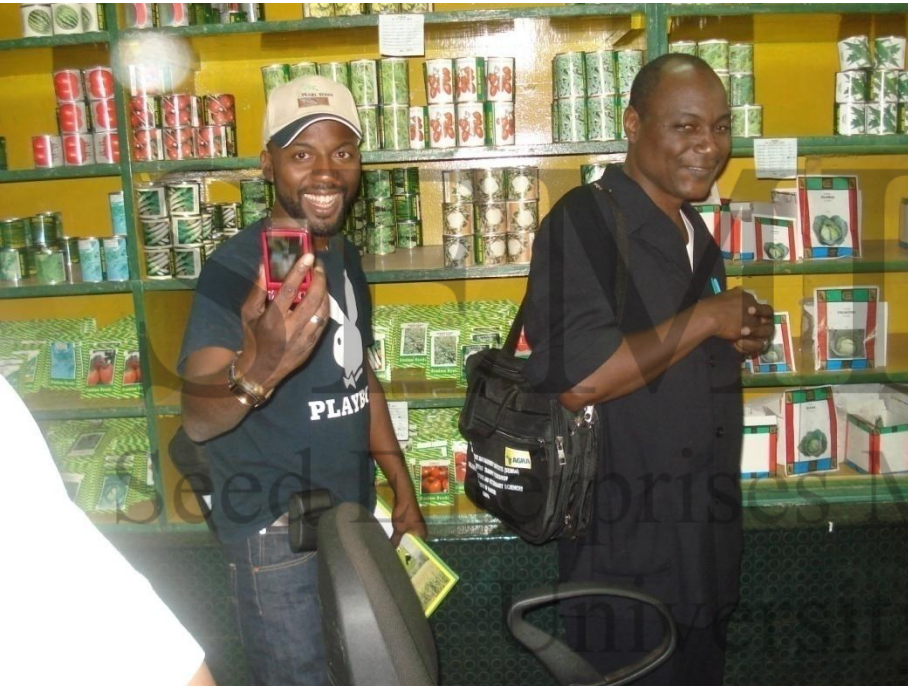
Visiting the seed industry- Visit to SIMLAW seeds