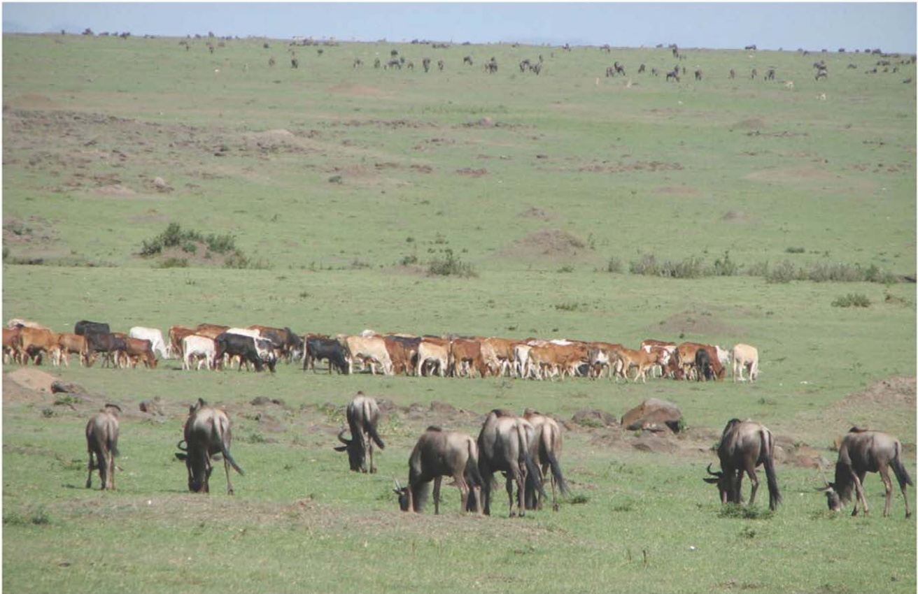
Figure 1. Mixed wildlife and livestock grazing. doi:10.1371/journal.pone.0043342.g001

questionnaires and so were assumed to be illiterate. Of the 56 pastoralists interviewed, 52 (92%) had a clear idea of the clinical appearance of mange. However, only 37 (66%) of these pastoralists understood the aetiology of mange (the respondents confirmed that they knew the cause of mange, i.e. that it is caused by small microscopic parasites not visible to the naked eye that could burrow under the skin), while 13 (23%) knew that mites were the causal agent (i.e. they stated that ilpepedo , the local name for the mite, is the origin of mange in animals). Thirty-nine (69%) believed that the cross-infection of mange between domestic and wild animals could occur (Table 1). When asked if their domestic animals had ever been affected by mange, 48 (85%) of them answered affirmatively. The animals involved were most commonly sheep and goats (Table 2). Interestingly, the pastoralists had