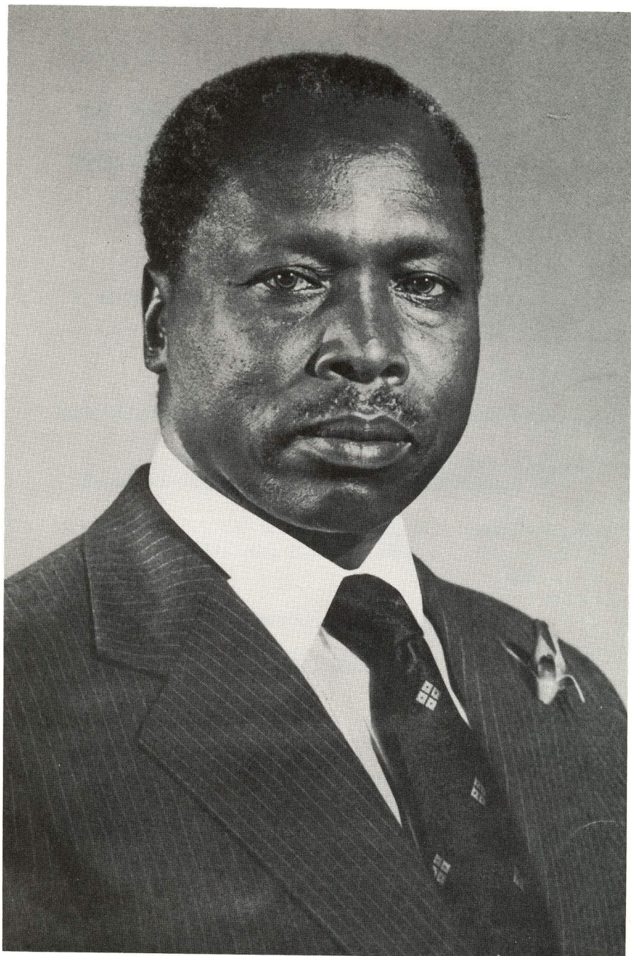
His Excellency the Hon. Daniel T. arap Moi, C.G.H., M.P., HON. LL.D. (NAIROBI), D.SC. (NEW BRUNSWICK), D.SC. (MOI), D.ED. (K.U.) Chancellor of the University of Nairobi and President of the Republic of Kenya and Commander-in-Chief of the Armed Forces.