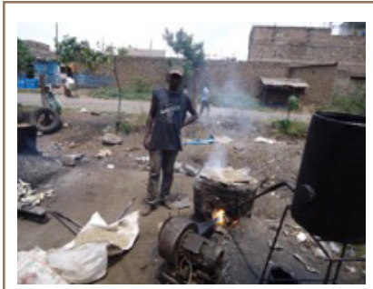
Figure 2 — Informal ULAB recycling industrial site near a preparatory school in a residential area in Dandora.