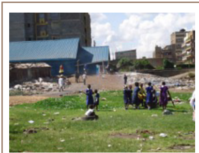
Figure 3 — Informal ULAB recycling waste dumps near preparatory schools and children's playgrounds within a residential area in Kariobangi (source: Ondayo, 2015).

prevailing winds (Figure 2) as well as ULAB recycling wastes dumped in the open near preparatory schools and children's playgrounds within residential areas (Figure 3). We also observed dust from the ULAB operations settling on surrounding soils and buildings. The lead contaminated soils and dust could become airborne when disturbed and blown by wind, causing widespread indoor and outdoor contamination. 32,33 Family members can also take home lead-contaminated soil and dust from outside when they enter the house