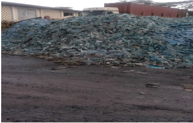
Plate 2: A mixture of chrome leather shavings and trimmings dumped outside the Leather Industries of Kenya (Thika) due to lack of a better disposal/recycling method