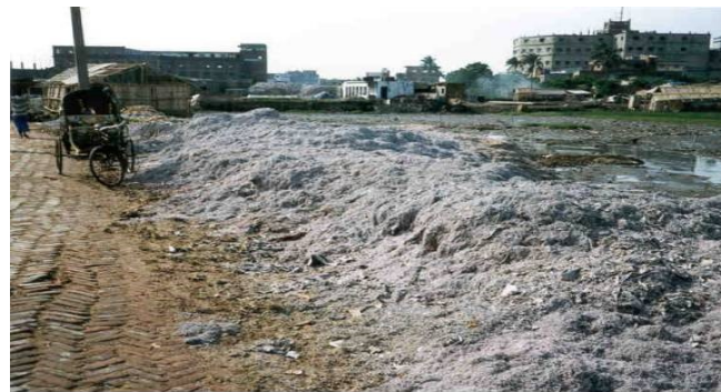
Plate 1: Dumping of chrome tanned leather solid wastes in a landfill