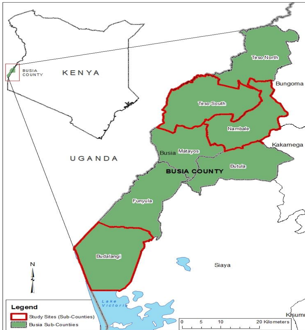
Figure 1: Aflatoxin study sampling areas within Busia County

towns) (Fig 1). Busia County is a major trading location that accounts for substantive trade between the two East African countries of Kenya and Uganda. The primary economic activities in Busia County are cash crop and subsistence farming, fish farming, trade in farm produce and artisanship. Figure 1 below provides an illustration of the study area.