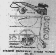
STANDARD MECHANICAL SCREEN WIPERS Shs. 2/0

Visors (Sun Glare Shields). From Shs. 24, 30 & 35.