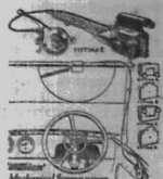
STADIUM MECHANICAL SCREEN WIPERS Shs. 30/-