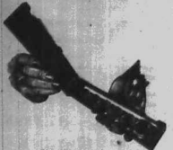
SOCKEY WRENCH From Shs. 4/- Various types of Span and Hatchet Wrenches in stock