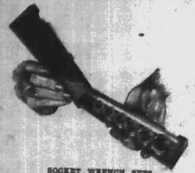
SOCKET WRENCH SETS From Shs. 4/- Various types of Hexes and Ratchet Handles in stock