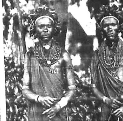
Portrait of a man in a suit, likely a member of the Land Settlement Board.

"It is a very important question, and it is one which is being dealt with by the Government."