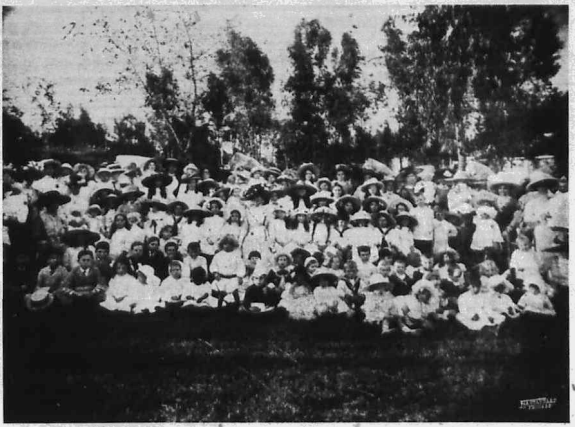
A group of children taken at Mrs. Currie's Christmas treat last week. (The original photograph is in the Standard (Blue Sheet).)