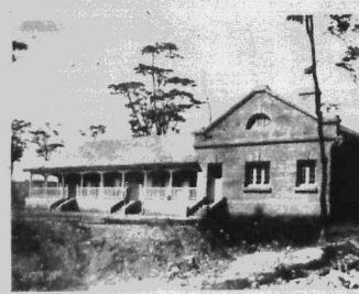
The Government Building, Nairobi, Kenya Colony.