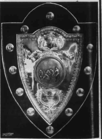
THE MERCHANTS HOCKEY SHIELD

This shield was presented to the M. H. Club, Nairobi, Kenya Colony.