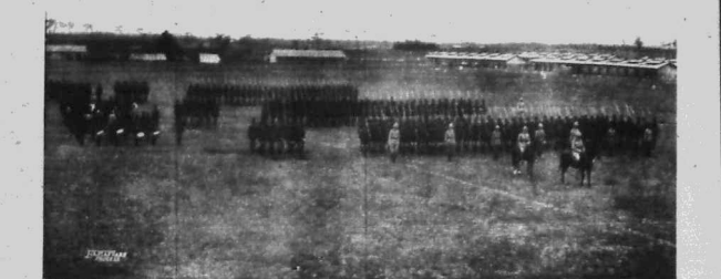
The King's African Rifles on Nairobi Hill.