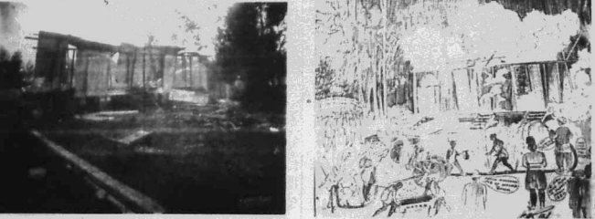
Low Suck's Farm. The United Kingdom.