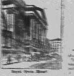
"Daily Open Door"

THE HONORABLE The "Daily Mail" has published a sensational article concerning the "British Government's" policy in regard to the "Eastern Question." The article states that the "British Government" is "determined to maintain its position in the East, and will not be driven from its position by any "Eastern Power." The article concludes by stating that the "British Government" is "determined to maintain its position in the East, and will not be driven from its position by any "Eastern Power."