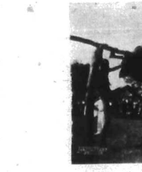
Native obstacle race.