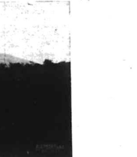
A typical Machakos view.