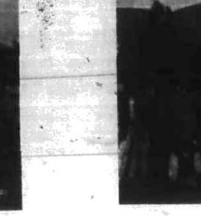
A group taken after the sports.