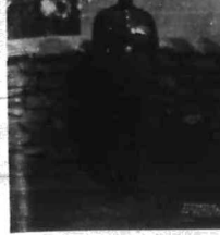
A well-known figure at Machakos.

The annual general meeting of the Machakos Volunteer Reserve was held on Saturday, Jan. 25, at 10.30 a.m.