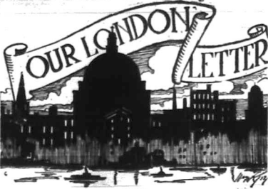
By His Special London Correspondent