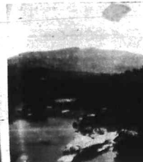
A typical Machakos view.