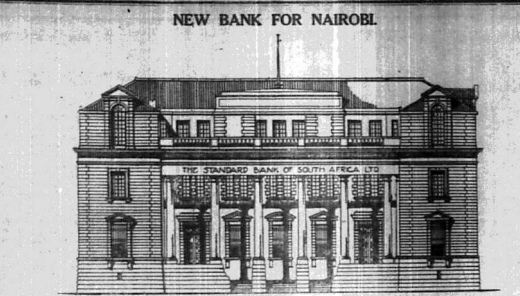
The new Nairobi office of the Standard Bank of South Africa to be built on two Sixth Avenue plots adjacent to the offices of the "East African Standard".