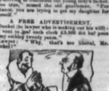
Portrait of a man in a suit, likely a person mentioned in the text.