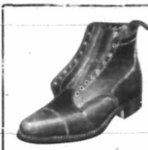
Rs. 11-75 pair.