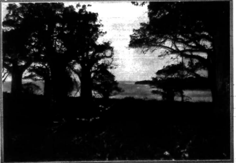
View of the coast from the beauty spot.