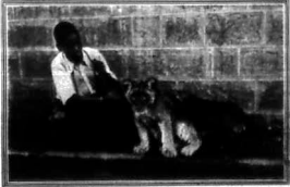
An unusual composition.