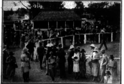
A scene in the Paddock.