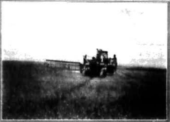
A view of a North Kenya wheat farm.