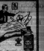
Convalescence. Seriously ailing and confined to the gentle work of "The East African Standard" is a member of the Church of the Holy Trinity in the East African Standard.

Two-Monthly Service to Bhopal by S.S. 'HOUGHTON'. Agents in Mombasa—: : Panchsheel Overseas Trading Co., Ltd., 'PROTOM'; Dalaly and Co., Ltd., PASSENGERS.