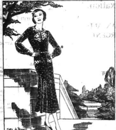
Brown and White. Illustrating the ways for spotted fabrics, this smart dress is brown crepe de chine above, white spots on a brown background, with white collar, bow and pocket flap and white spotted with blue.

If you do not wish to create the all-in-one effect, the bodice can be made in a different color and perhaps a different material. It is smart to wear a plain blouse of blue, yellow, or pink, striped or spotted, skirt, and in a quiet, an smart to have a striped or spotted