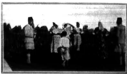
Some of the girl pupils with their certificates.