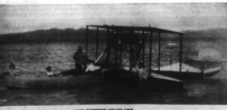
THE BRITISH SEAPLANE.