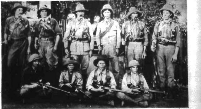
PLATEAU SOUTH AFRICANS.