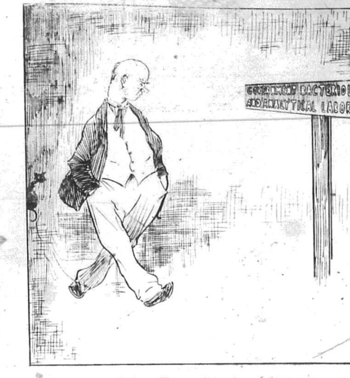
THE EAST AFRICAN STANDARD'S COPYRIGHT.]

[THE EAST AFRICAN STANDARD'S COPYRIGHT.]