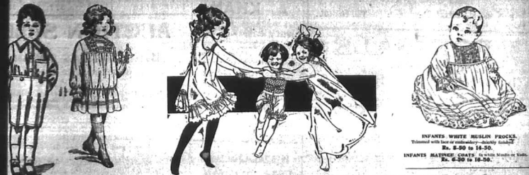
INFANTS WHITE MUSLIN PROCKE. Treated with heat or antiseptic quality liquid. Rs. 2.50 to 14.50. INFANTS BATHING COATS. 6.00. Made in India. Rs. 6.50 to 12.50.

GREENAWAY SUITS. White drill edged pink blue or grey. Rs. 3.75 & 4.50. DAINTY FROCKS FOR LITTLE GIRLS. Exclusive models in white voile from Rs. 6.50 to 32.50. SWEET LAVENDER UNDERWEAR FOR CHILDREN has a distinction of its own—exquisite in quality, dainty in style, perfect in fit and health and economical in wear. All sizes from 1 to 5. English — Rs. 1.00 to 1.50 | Children — Rs. 1.00 to 1.50 Ladies — Rs. 1.00 to 1.50 | Children — Rs. 1.00 to 1.50 Youth — Rs. 1.00 to 1.50 | Children — Rs. 1.00 to 1.50 SWEET LAVENDER UNDERWEAR FOR LADIES English made with all the qualities of the best English manufacture English — Rs. 1.00 to 1.50 | Children — Rs. 1.00 to 1.50 Ladies — Rs. 1.00 to 1.50 | Children — Rs. 1.00 to 1.50