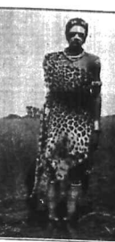
GORI MEDICINE MAN.

"Young as it is this Protectorate already has a native problem. This is probably due to the fertility and abundance of a land which allows the natives to satisfy their wants, almost without an effort. Until the native, like the white man, is compelled by economic forces to labour in order to live, this problem is likely to become more and more acute."