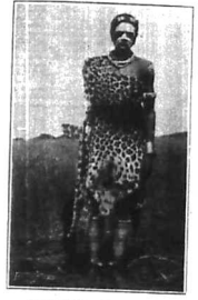
GORI MEDICINE MAN.

"Young as it is this Protectorate already has a native problem. This is probably due to the fertility and abundance of a land which allows the natives to satisfy their wants, almost without an effort. Until the native, like the white man, is compelled by economic forces to labour in order to live, this problem is likely to become more and more acute."