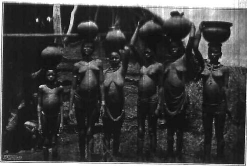
KAVIRONDO WATER CARRIERS