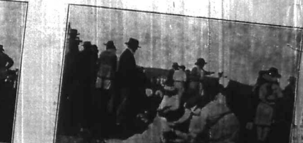
LADIES MAKING TEA ON THE RACE COURSE.