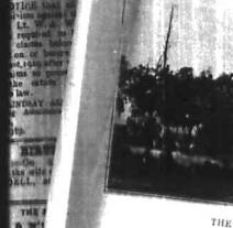
THE NATIVE OBSTACLE RACE.