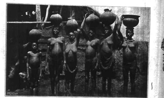
KAVIRONDO WATER CARRIERS.