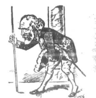
Keir Hardie as a Lord-in-Waiting.

There was another letter from Mr. Keir Hardie, which I will quote here. He said: