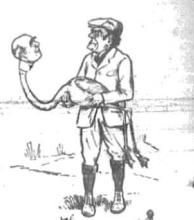
A Flamingo with the Head of "Archbishop of Canterbury."