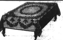
TABLE COVERS Green and Crimson Size 8 by 4 LADY'S Tweed Skirts Rs. 28-75. Rs. 37-50

PLAIN PLUSH DITTO Crimson, Green and Blue, Size 8 x 4 Luvise Silk Blouse in all Shades Rs. 112-50 Rs. 13-75 each