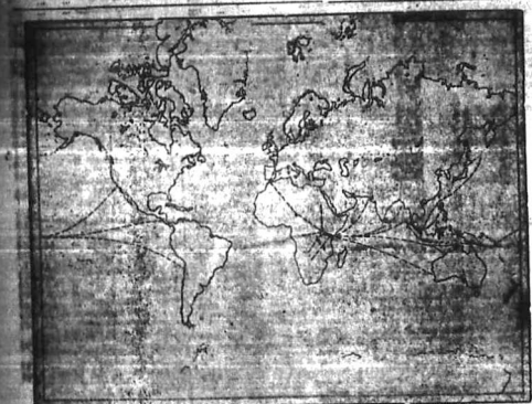
CREAT KILINDINI HIGHWAY.