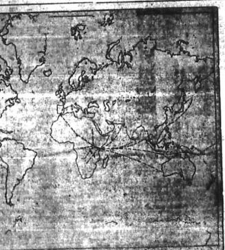
GREAT KILINDINI HIGHWAY.