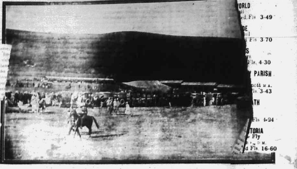
A PANORAMIC VIEW OF THE SHOW GROUNDS