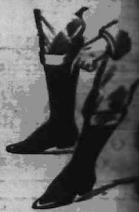
64E. Fine quality all Cashmere half hose, color with unshrinkable silk mesh. Revised Price, Rs. 2-75