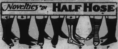
D126. Steel Gray Cashmere half hose, good shape all sizes close a real hard wearing sock. Revised Price, Rs. 1-25 per pair.