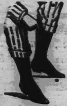
58E. Men's Cotton half hose in black and white grey and tan conventional stripes. Revised Price, Rs. 1-25