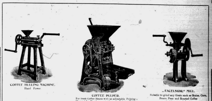
COFFEE HULLING MACHINE. Hand Power. COFFEE PULPER. For treating Coffee Beans with an adjustable Pulping Chamber for Handpower (with spare Pulping Roll). Mangle. Suitable for grinding any Grain such as Malacca, Corn, Beans, Peas and Roasted Coffee (with spare plates).

For Prices apply to Manufacturers' Depot, Mombasa, East Africa House.