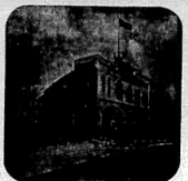
M. MACJOHN & Co., Proprietors