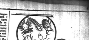
Illustration of a person sitting at a table, possibly a waiter or a customer, in a dining setting.