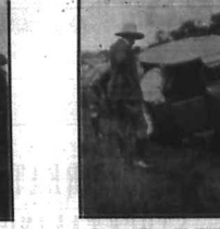
CAR STOCK (Lafayette Hotel)