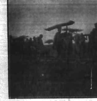
NATIVES FLATS LAYING