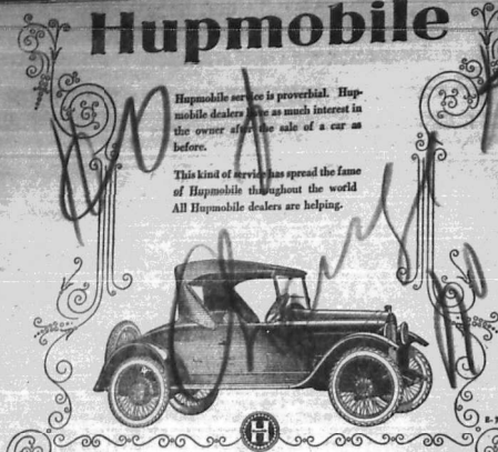
The Motor Agents & Exchange, Ltd. Sole Agents & Distributors: KENYA & UGANDA. Nairobi, Kenya.