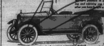
Deferred terms of payment arranged if desired.