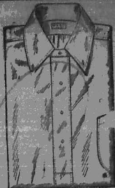
White Twill Trussard Shirts with Point Collar starched will wash and wear well all season long This week Shillings 6