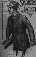
Ready to wear Sports Coats made from good Irish Tweed in light and dark colors size 34" to 44" chest. This week Shillings 25