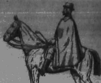
Gents Fawn Parasolts Walking or riding Capes complete with Shoulder straps and leg straps length 46 inches wonderful Value.