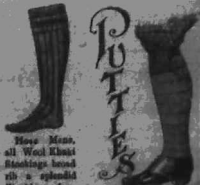
Heavy Men's all Wood Khaki Stomping boots with a splendid finishing for Sports wear. This week Shgs 4 pair.