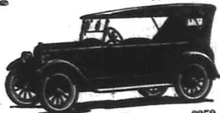
DURANT FOUR TOURING CAR £250

DURANT BOBYS BOX BOBYS IMMEDIATE DELIVERY. £218