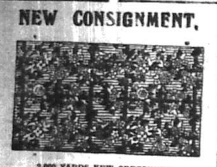
NEW CONSIGNMENT. An accident occurred at High Road Station...