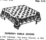
TAPESTRY TABLE COVERS. In rich Colouring very heavy Tapestry in Red and Green...