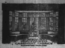
WASTOLITE CASHMERE FABRICS

The Rainy Season need never be a dull time if your Home is bright with gay furnishings, now is the time, the indoor time, to renovate Chairs, Covers and Carpets.