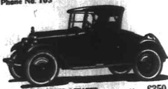
FORD ROADSTER SEATER £350

DURANT BOBYS BOX BOBYS IMMEDIATE DELIVERY. £218