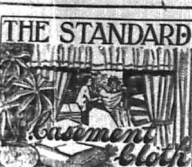
THE STANDARD. The most important thing is to satisfy a Customer...