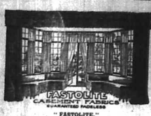
FASTOLITE. The history of Lord Albion's Master Robert...