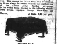
VELVET PILE. Table Covers are the making of your Dining room...

Another example of this Pretty Containing, but the Appearance of it, with heavy Insertion and Lace Edges, 5/11 wide. 5/17