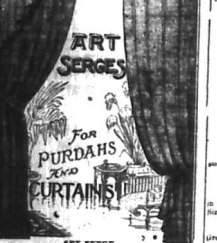
ART SERGE. It is wonderful for making your Home Comfy for those Comfortable Table Cloths...