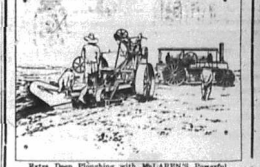
Extra Deep Ploughing with McLaren's Powerful STEAM CARriage TAKING