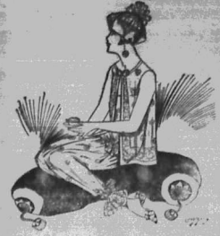
The Miss Paragon thinks the therapeutic idea into the routine of hygiene. Here is a handy sleeping suit, in printed paper, containing 'satin' and 'ladies' in one, and a separate little dress for school.