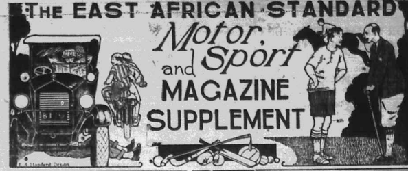
SUPPLEMENT No. XXXIX. SATURDAY, NOV. 6, 1932. NAIROBI.

THE EAST AFRICAN STANDARD WEEKLY EDITION. Motor Cars & Motor Cycles. SCISSORS AND PASTE Italian tires are being fitted to 3,000 Park taxi-cabs belonging to the War Department company in London. Vulcanized tire info and net of Manchester has increased more than 25 per cent since 1920, making it difficult to get a good quality at the authorities. A recent trial was made to establish the fact that about 20,000 vehicles of this kind only at 100,000 net were down. Figures compiled in 1930 show that 1,120,000 motor vehicles were being used by the forces and bridges daily.