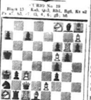
Black to play and has the move. The chess problem was solved by... The chess problem was solved by... The chess problem was solved by...