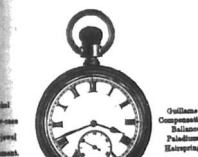
THE SETTLES WATER 1849