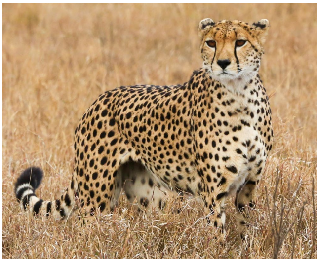
FIGURE 1 Cheetah, Acinonyx jubatus , in East African savannah.

We conducted our study in the following eight ranches: Kima, Malili, Aimi Ma Kilungu, Ngaamba, Game Ranching, Lisa, Machakos Ranching, and Kapiti Plains Estate, all located in the greater Athi Kapiti Plains in south-eastern Kenya (S 1.30.25, E 37.0.34 and S 1.42.44, E 37.12.0; Figure 2). These ranches cover approximately 450 km 2 . The region is a semi-arid savannah region with a mean annual rainfall of 510 mm, which is divided into two rainy seasons, with long rains in March–April and short rains in September–October (Jaetzold et al., 2006). The vegetation predominantly consists of Themeda triandra ,