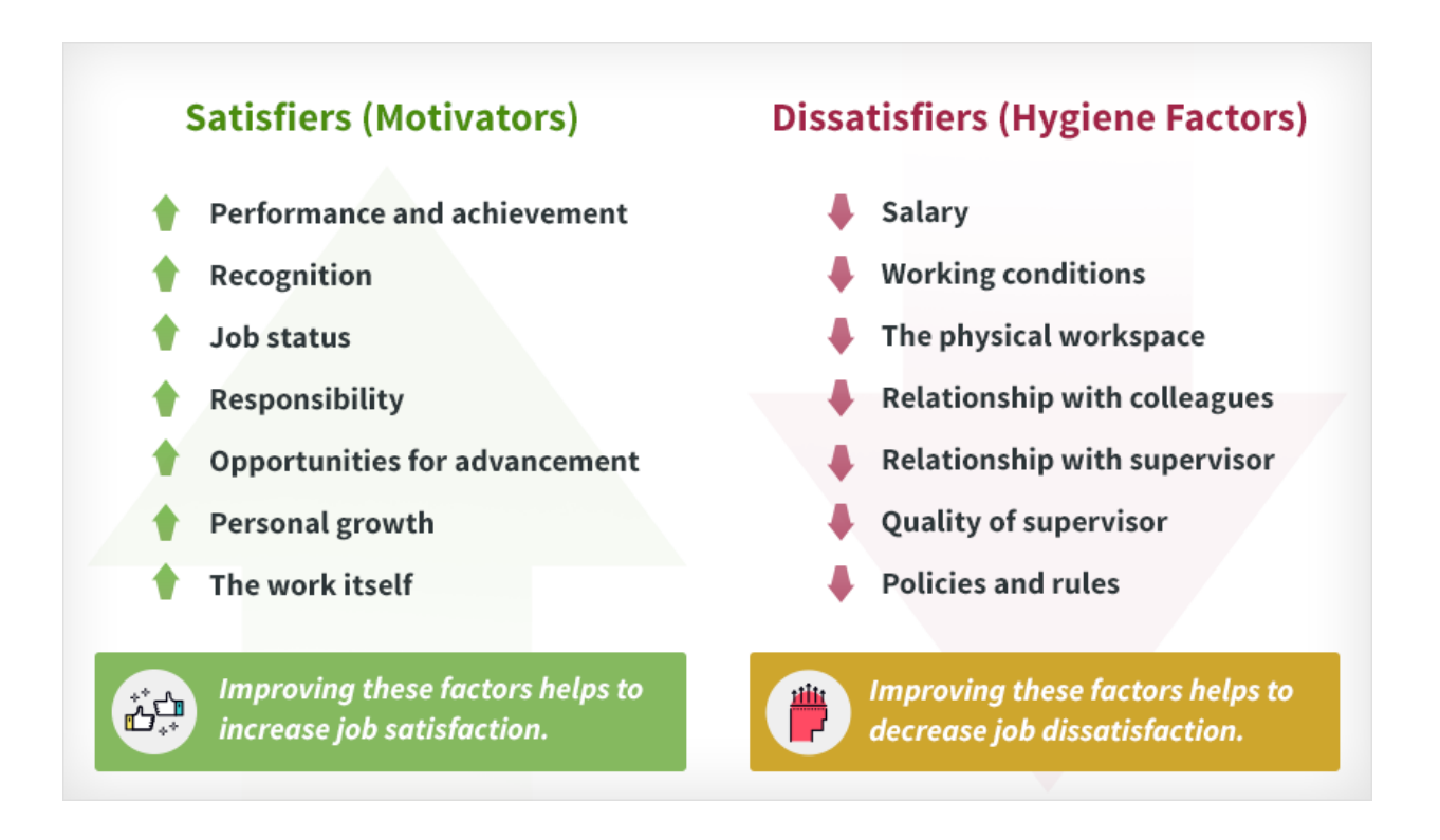
Figure 2.1: Herzberg's view of satisfaction and dissatisfaction

According to the theory, motivators (achievement, recognition, the satisfaction of the work itself, responsibility, and opportunities for advancement and growth) make up the majority of factors that affect job satisfaction, while hygiene factors make up the majority of factors that influence job dissatisfaction (company policy, general working conditions). There are workplace variables that affect both job satisfaction and discontent, one of which operates independently of the other. The study sought to understand how the motivating and hygiene elements influence the working conditions of women in the flower farms.