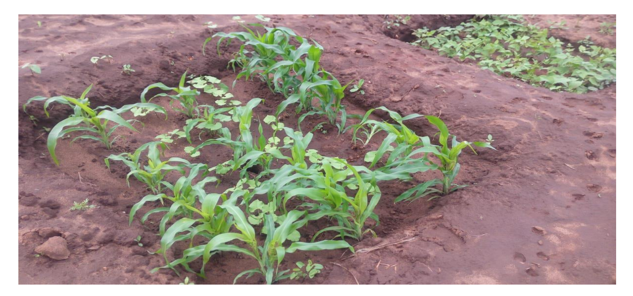
Plate 1: Maize and beans under Zai pits Photo: Kelvin Wafula, taken on 11/11/2019

Zai pits were constructed by digging the top soil to a depth of 30 cm with a hand hoe. The first 0-15 cm soil was piled on one side, and that from 15-30 cm was piled on the lower side of the pits to trap water in case of a runoff, leaving a pit (Zai) at the center (plate 1). The top 0-15 cm dug-out soil was then mixed with the fertilizer and manure treatments and returned to half-fill the pit before planting, to maintain the original fertility status. Planting was done inside the pits.