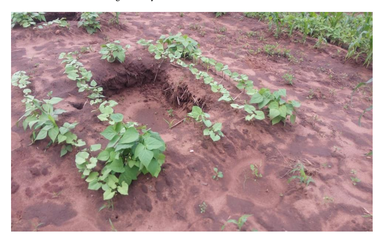
Plate 2: Maize and bean planted under Ngolo pits Photo: Kelvin Wafula, taken on 11/11/2019

Maize and beans seeds were planted on the heaped soils while the Ngolo pits were left bare to collect and hold water during the rainy season.