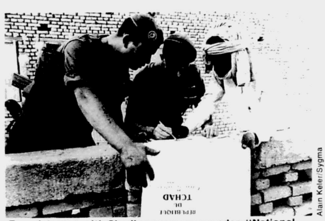
French troops with Chadian army commander: "National reconciliation will not be successful unless all non-Chadian troops leave the country"

GAMBARI: There is really not much more to say other than that the readers of Africa Report , in Africa, North America, Western Europe, and elsewhere, should rest assured that the new administration in Nigeria is a progressive one, is a nationalistic one, is a committed one, and, before very long, we are going to overcome the present economic difficulties, which we consider to be temporary in nature, and we are going to resume a truly activist foreign policy and a truly nonaligned one.