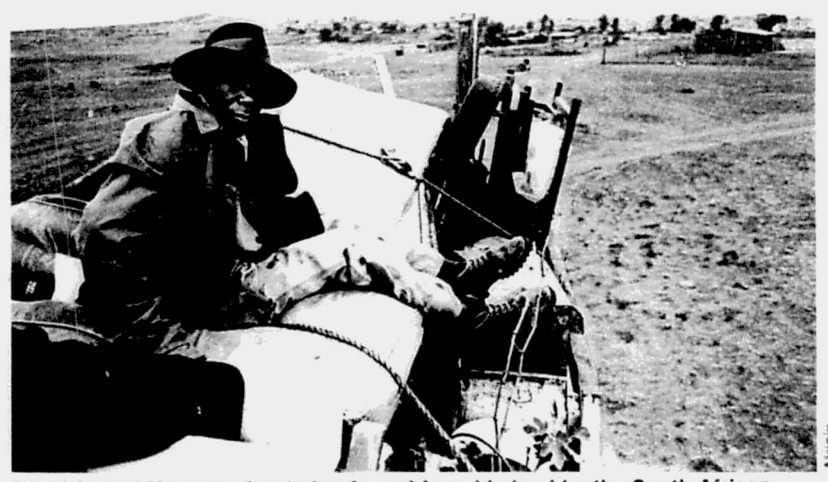
A resident of Mogopa after being forced from his land by the South African government earlier this year: "Constructive engagement has not won any meaningful concessions, rather it has encouraged South African intransigence"

Moreover, Ethiopia's new alignment with the Soviet Union, which is a reversal of the political pattern of alignment during Emperor Haile Selassie's regime, pits Somalia against the Soviets and at the same time propels it towards the conservative Arab monarchies who previously were political allies of imperial Ethiopia. This paradoxical situation should be noted by U.S. policymakers, for it reveals clearly that no situation is permanent and that U.S. interests can best be served only through a consistent foreign policy ap-