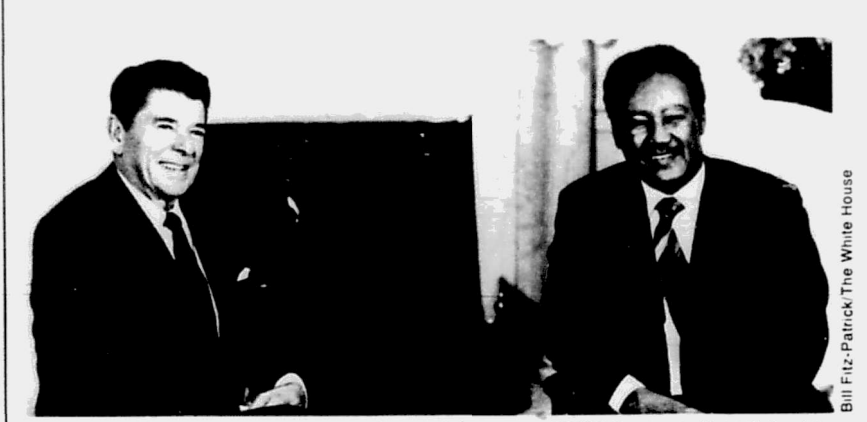
Presidents Reagan and Nimeiry at the White House: "AWACs were dispatched to Egypt to bolster Egyptian and Sudanese air defenses after the Omdurman bombing"

However, not one of the Sudanese I spoke to three days after the event was prepared to fully accept this version. Conspiracy theories were rife in Khartoum. Was the plane in fact a Sudanese aircraft flown by dissident air force