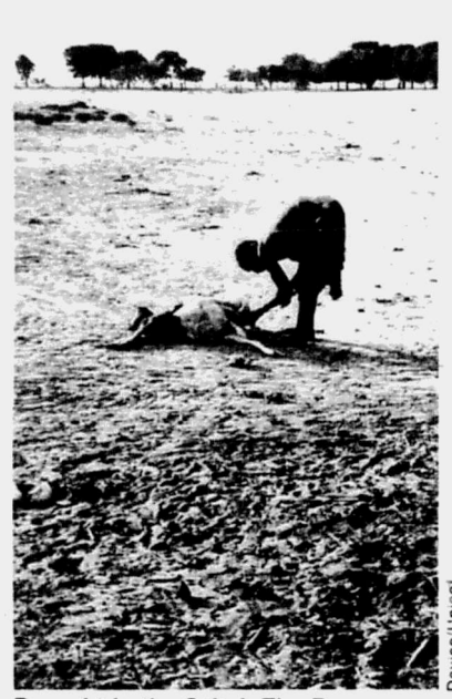
Drought in the Sahel: The Reagan administration has appropriated only $1.50 per capita for Africans severely stricken by drought and starvation

concessional loans in a depoliticized format. I would encourage U.S. companies to invest in Zimbabwe, help to increase the economy's capacity to expand, and regain a viable trading partner. Moreover, I would support a subsidized land reallocation program by the government to obviate problems of land distribution and thus reduce this