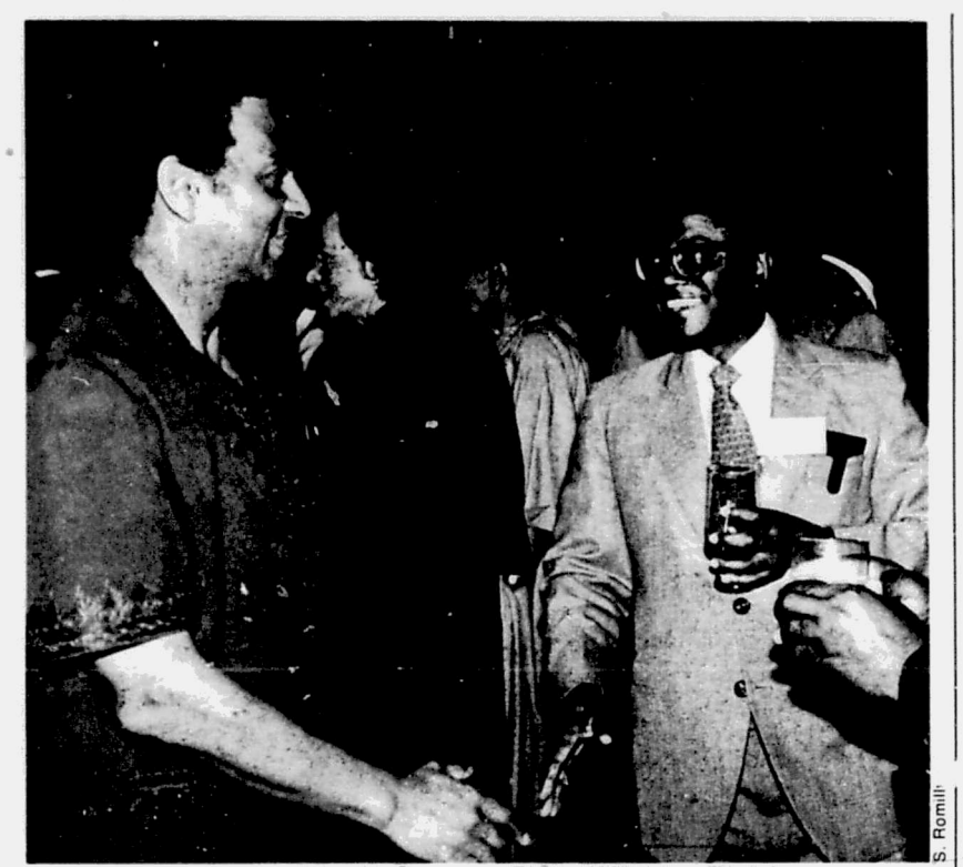
Andrew Young, mayor of Atlanta, greeting Zambian Foreign Minister Lameck Goma: "In order for Africa to deal with its economic problems, it must do business with the United States"

14 percent of this total. This proportion of military aid is significantly higher than under previous administrations.