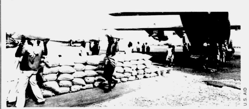
U.S. food aid arriving during 1970s Sahei drought: "The current level of food aid is far below what the U.S. must contribute if the continued starvation of millions of Africans is to be curtailed"

These will be extremely difficult discussions, but painfully necessary for continued growth in developed and developing countries. The experience of the Lomé Convention is a small but positive example that can be built upon. Should the U.S. see it as in its self-interest to make economic allies of the developing nations, the result will be greater prosperity for all. Until such a consistent and coherent policy is followed, our influence will continue to decline in a region of the world that we greatly depend on for our own growth and prosperity.