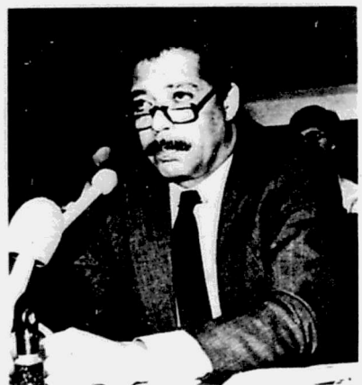
Congressman Julian Dixon testifying before the House Banking Committee on legislation restricting U.S. support for IMF loans to South Africa

Congressman Julian C. Dixon (D-Calif.) is chairman of the Congressional Black Caucus.