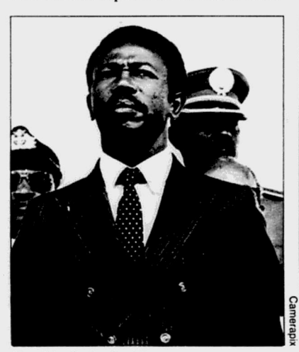
Mengistu: Feeling Soviet pressure

Soviet pressure on the Ethiopians to form a communist party is in part an effort to institutionalize the party before the individual inclinations of members of the Central Committee send the revolution "astray." The Soviet pressure was illustrated by reports that Ethiopia had expelled two Soviet diplomats in late Febru-