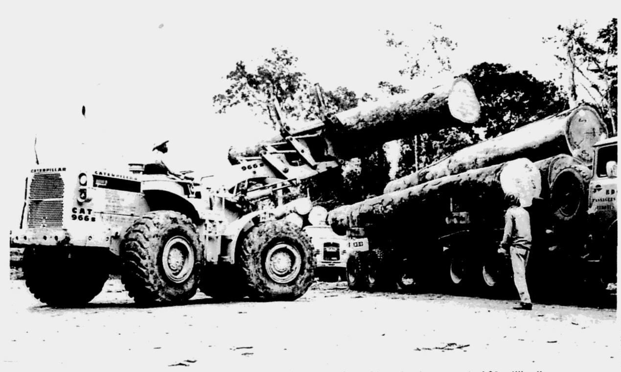
Timber in Gabon: "Our contacts have produced orders for timber from Africa in the amount of $3 million"

BRADLEY: On the question of blacks involved in the political process, I think there is no question about it. The rate of voter registration among blacks and the high turnout experienced in the primaries has clearly demonstrated that Jesse Jackson has been a force in that regard. I think that New York is perhaps the best example of the tremendous outpouring of interest, given the huge turnout that was experienced in the primaries.