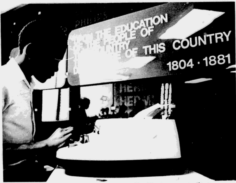
Pace vocational school in Soweto, supported by Western corporations: "Corporations have a responsibility to help change the system or they have no moral justification for remaining in South Africa"

there should be immediate divestment actions by stockholders, institutions, pension funds, government bodies, and other fiduciaries. Although I am aware that these 150 nonsignatory companies represent only 20 percent of all investments of American companies in South Africa, it is still my opinion that all American companies should be measured by the same exacting standards