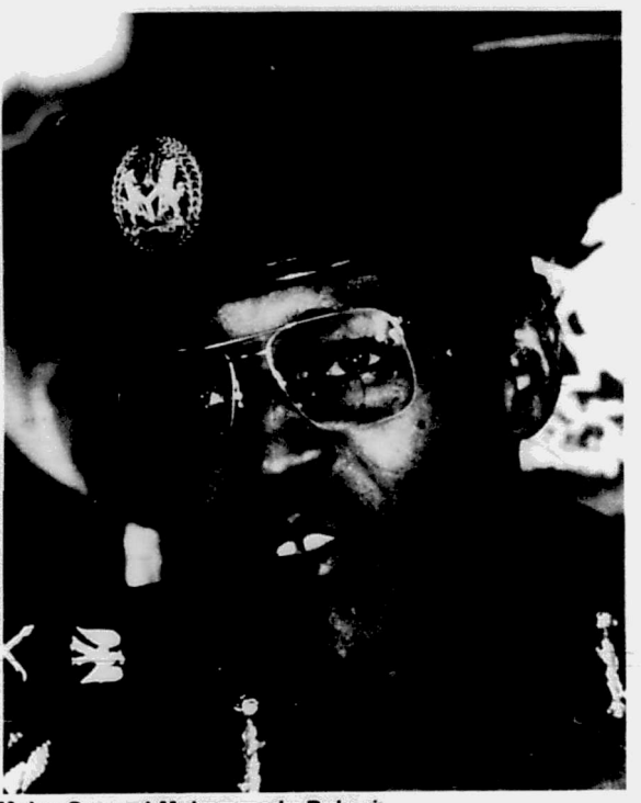
Major General Muhammadu Buhari: "Under his administration, Nigeria will pursue a dynamic but realistic foreign policy"

We believe, however, that ECOWAS can move forward if members will implement the protocols and agreements that have already been reached in very many summit meetings of the heads of state and government of ECOWAS, because ultimately nations have to see their national interest in