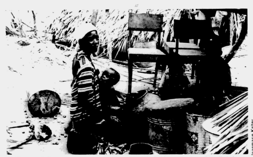
At Changanine, a camp in Gaza for women and children displaced by fighting between the MNR and government forces

There has been much talk since independence about these problems, but only recently has anything been done.