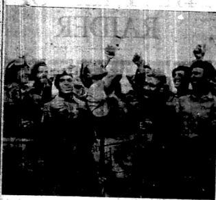
Men of a tank regiment find time to take a swift out of a bottle in a full between battles in the Western Desert.