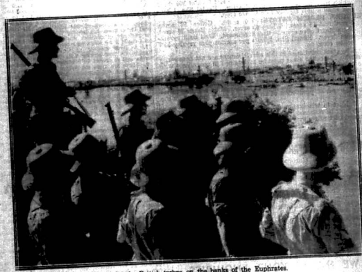
In Baghdad. British troops on the banks of the Euphrates.