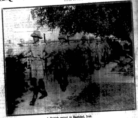
A British patrol in Baghdad, Iraq.