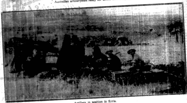
Artillery in position in Syria.