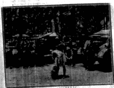
A halt amongst the Palms in Iraq.