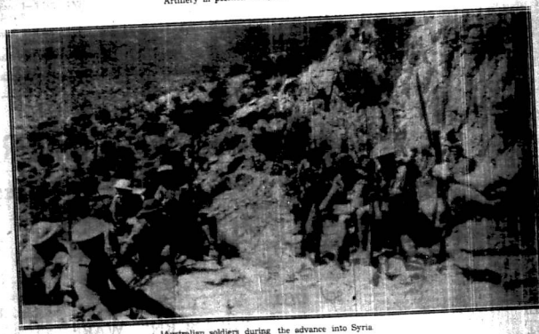
Australian soldiers during the advance into Syria.