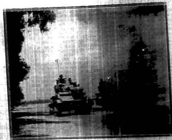
Australian tanks on reconnaissance in Syria.