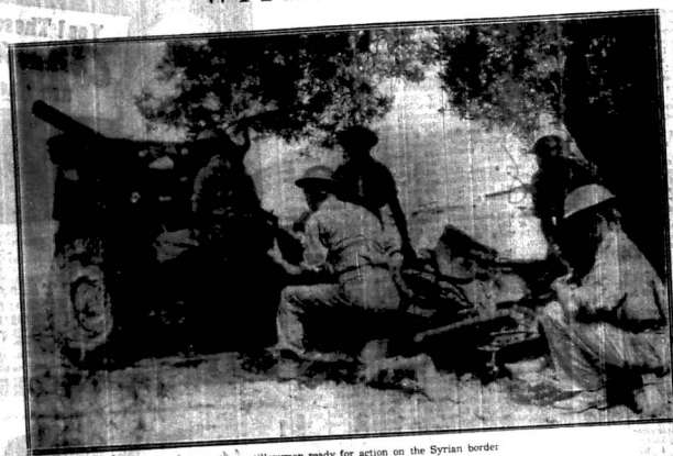
Australian artillerymen ready for action on the Syrian border.