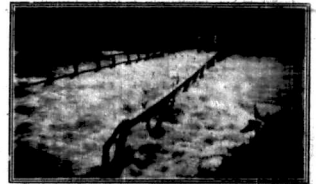
The road bridge on the main Emboret-Kakamega road, which crosses the Ripharian River. This is the first occasion since the bridge was built in 1921 that flood water has risen above the bridge level.