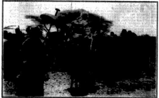
Old and young. Men, women and children of all ages are among the 8,000 refugees at Isalo.