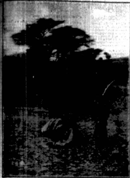
Young survivor of one of the most remarkable trials in modern African history, Abyssinian children at a concentration camp in the Northern Frontier District.

REFUGEES IN KENYA During July thousands of refugees from the South Western parts of Abyssinia arrived in the Northern Frontier District of Kenya. They included families of good standing, peasants, slaves and soldiery (both Abyssinian and Italian). They were armed with machine guns and rifles and had one anti-aircraft gun. Pending the decision regarding their future they have been concentrated in a special camp.