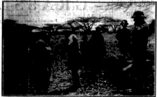
Intended: The fight against the menace of smaltz by the Kenya Medical Department was one of the most outstanding features of the story.

REFUGEES IN KENYA During July thousands of refugees from the South Western parts of Abyssinia arrived in the Northern Frontier District of Kenya. They included families of good standing, peasants, slaves and soldiery (both Abyssinian and Italian). They were armed with machine guns and rifles and had one anti-aircraft gun. Pending the decision regarding their future they have been concentrated in a special camp.