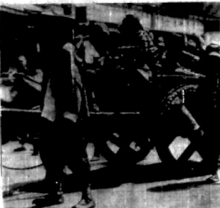
A pathetic picture of refugees fleeing from their homes in North China. It is reported that cholera has broken out among the refugees who have crowded into Shanghai, and another outbreak is announced from Hongkong.

The British steamer "Woodford" was struck off the south coast of Spain. One man was killed and six wounded, and the steamer sank within three hours.