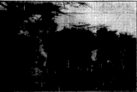
How the refugees arrived. A picture typical of the flight.