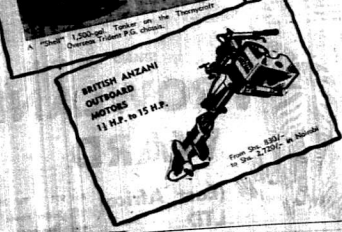
BRITISH ANZANI OUTBOARD MOTORS 11 H.P. to 15 H.P.