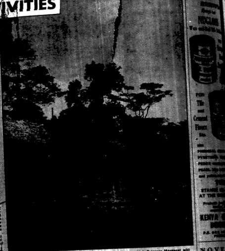
A view of the princess's box in the main arena - from which Princess Margaret will watch part of the show - and the main grandstand in the background.

On Friday afternoon, the presentation of B.A.K. long-service medals will be held in the arena.