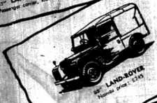
66" LAND ROVER Nominally priced at £145