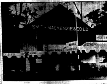
Stand with the agricultural character of the Royal Show. The Mackenzie stand, Mackenzie and Co., Ltd. is in the foreground.

Rowland Ward Ltd. (East Africa) LTD. 88 991 Tel. 25509