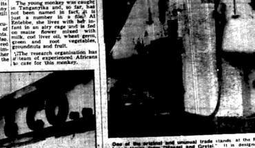
One of the original but unusual trade stands at the Royal Show is this model of the Gipsy-ferret from 'Holland and Great'. It is designed to attract attention to the sale of children's woollen clothes by the Harrold shop, Surbiton.

Monkey and Virus Research Institute Visitors to the display of the East Africa High Commission will see a young African monkey and his six-month-old baby from the East Africa Virus Research Institute.