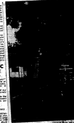
One of the big improvements at Millbank Park for this year's Royal Show was the new terrace, which will enable guests to see the water in the wet-land and keep warm and dry if it is raining. The terrace is well-ventilated and the water in the wet-land is well-ventilated.

McKenzie is now producing a whisky which is a blend of Scotch and African whiskeys. McKenzie is now producing a whisky which is a blend of Scotch and African whiskeys.