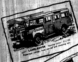
107" LAND ROVER Van with canopy Powered canopy, load control and sleeping cot